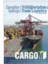
JANUARY 27, 2014 CargoM: PROMOUVOIR MONTRÉAL EN TANT QUE PLAQUE TOURNANTE MULTIMODALE Canadian Sailings