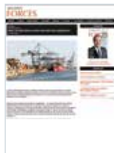
DECEMBER 17, 2013 PORT DE MONTRÉAL, PORTE D'ENTRÉE DES AMÉRIQUES Magazine Forces