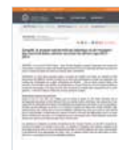
JUNE 19, 2013 ANNUAL ASSEMBLY CargoM