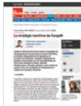
APRIL 2, 2014 THE MARITIME STRATEGY CARGOM La Presse