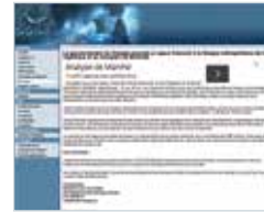
NOVEMBER 15, 2013 LE GOUVERNEMENT DU CANADA ACCORDE UN APPUI FINANCIER À LA GRAPPE MÉTROPOLITAINE DE LA LOGISTIQUE ET DU TRANSPORT DE MONTRÉAL LeLéopard