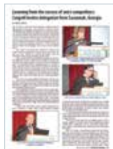
MARCH 24, 2014 PORT OF Montréal : AT THE HEART OF GLOBAL SUPPLY CHAIN Canadian sailings