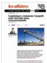
JULY 1, 2013 CARGO Montréal CREATES 'HUB OF EXPERTISE' Les affaires