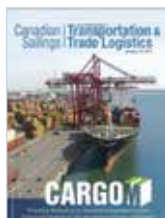
JANUARY 27, 2014 CARGOM: PROMOTING Montréal AS AN IMPORTANT TRANSPORTATION CLUSTER. Canadian Sailings