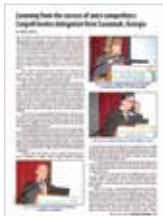
MARCH 24, 2014 PORT DE MONTRÉAL : AU CŒUR DE LA CHAÎNE D'APPROVISIONNEMENT GLOBAL Canadian sailings