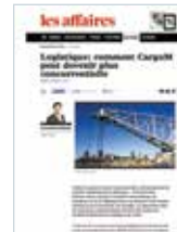
JANUARY 21, 2014 LOGISTIQUE : COMMENT CargoM PEUT DEVENIR PLUS CONCURRENTIELLE Les Affaires