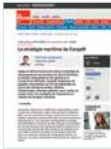
AVRIL 2, 2014 LA STRATÉGIE MARITIME DE CargoM La Presse