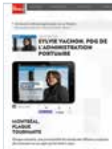
MARCH 24, 2014 SYLVIE VACHON : PDG DE L'ADMINISTRATION PORTUAIRE La Presse+