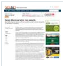
JUNE 19, 2014 CARGO MONTRÉAL GAGNE DEUX PRIX mmdonline.com