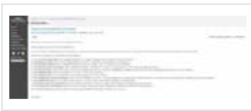
JUNE 19, 2014 GRANDS PRIX D'EXCELLENCE EN TRANSPORT Québec Municipal