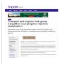
JUNE 16, 2014 CargoM DÉVOILE SES RÉSULTATS 2013-2014 Canadian Shipper