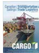
JANUARY 27, 2014 CargoM: PROMOUVOIR MONTRÉAL EN TANT QUE PLAQUE TOURNANTE MULTIMODALE Canadian Sailings