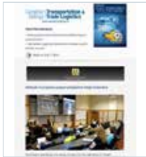
JULY 7, 2014 TRANSPORTATION & TRADE LOGISTICS Canadian Sailing