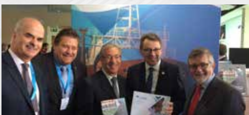
Quebec Maritime Strategy Trade mission in the United Kingdom in May 2017