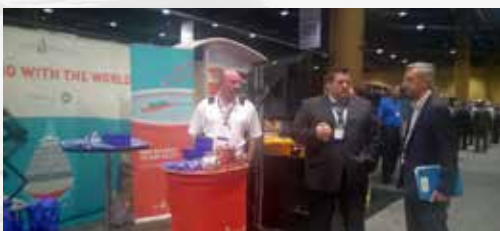
Retail Supply Chain Conference of the Retail Industry Leaders Association (RILA) in Orlando in February 2017