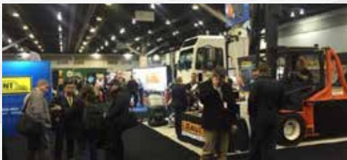
Cargo Logistics Canada in Vancouver in February 2017 (event held in Montreal in 2016, thanks to CargoM)