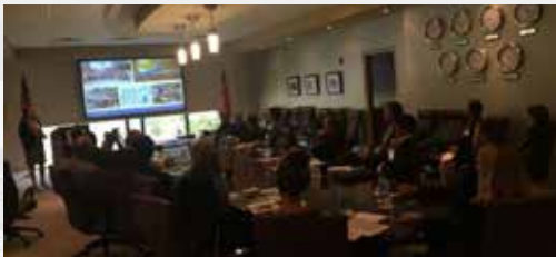
Logistics mission, organized by CargoM, in Savannah in October 2016