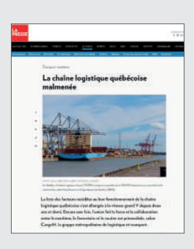
October 11, 2022

June 6, 2022 — Transport Magazine Cargom toujours aussi mobilisée pour la chaîne d'approvisionnement du grand Montréal