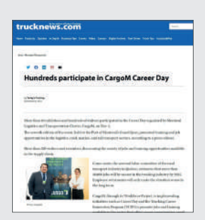
November 6, 2022

November 4, 2022 — Transport Routier CargoM rassemble le secteur du transport et de la logistique lors de sa Journée carrières