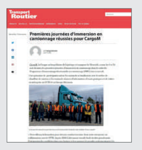
May 19, 2022

DC Velocity One-day program provides "immersive experience" in trucking