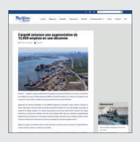
February 3, 2023

February 3, 2023 — Transport routier Hausse de 10 400 emplois directs en transport et logistique à Montréal depuis 10 ans : CargoM