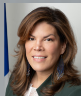
Kateri Champagne Jourdain

The Minister of Economy, Innovation and Energy, Minister Responsible for Regional Economic Development and Minister Responsible for the Metropolis and the Montreal Region