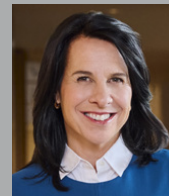
Valérie Plante Mayor of Montréal

Last but not least, I would like to warmly congratulate the entire CargoM team for the remarkable work accomplished over the past year. Thanks to their efforts, we can maintain a dynamic, fluid and efficient supply chain, benefiting both our industry and the entire Montréal community. Together, let's continue to build a sustainable and prosperous future for Montréal.